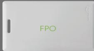
Thick / Clamshell Card