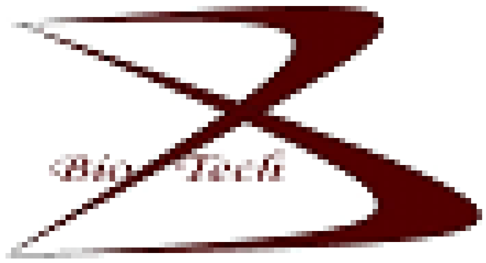
FHT-B-100 Single Door